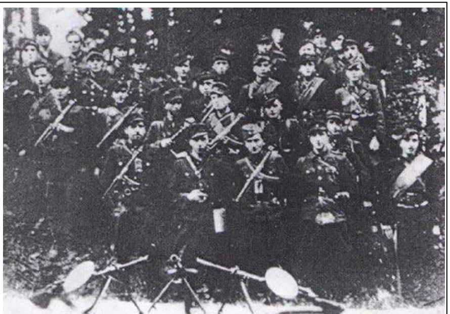
Surviving soldiers of 95 Company of the UPA, moments before turning over their weapons to US Forces in West Germany on 11 Sept 1947.